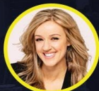
MEGAN ALEXANDER Correspondent at Inside Edition