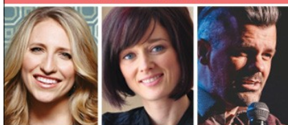
LAURA STORY Guest Speaker & Recording Artist